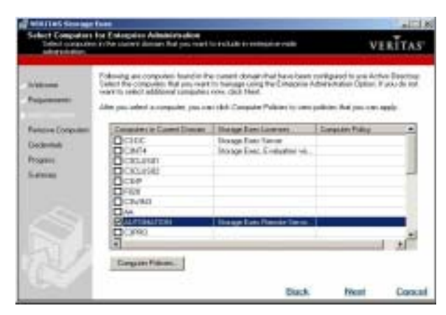
Storage Exec's Enterprise Administration Option makes it easier to manage your company-wide storage.

Enterprise Administration Option: The Enterprise Administration Option (EAO) integrates storage management with Windows Active Directory for easier administration of enterprise-wide storage management. In addition, users can establish space allocation alarms and actions, schedule report generation, receive chargeback reports, block unauthorized content and integrate with data protection and availability products via Active Directory hierarchical object management.